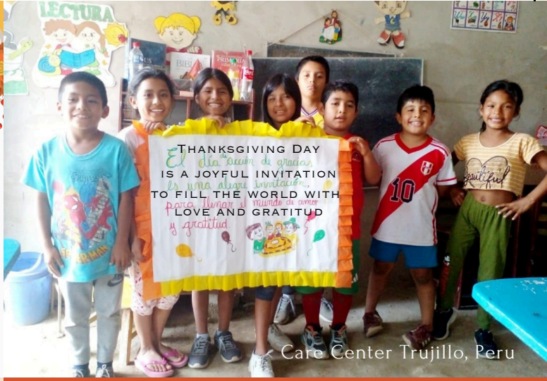
Care Center Trujillo, Peru

Tzedakah is a Hebrew word that refers to what we call in English "charity," meaning the act of giving aid, assistance, and money to those experiencing poverty, those in need, and other worthy causes. The word is actually derived from words meaning "justice" and "righteousness." In Judaism, Tzedakah is considered one of three acts that can gain us forgiveness of our sins; repentance and prayer are the other two. Some sages refer to it as the greatest commandment. For Christians, it is worth noting a strong emphasis on almsgiving in the Gospels!