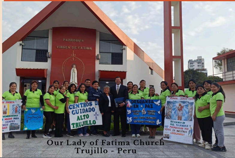
Our Lady of Fatima Church Trujillo - Peru

If you are interested in visiting Alto Trujillo, please contact our board members directly or at info@ministryofthegoodshepherd.org